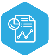
Business & Financial Reporting Requirements