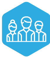
Audit & Risk Committee Guidance