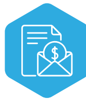
Remuneration & Superannuation