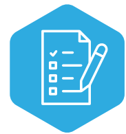
Board Self-Assessment Evaluation Questionnaire